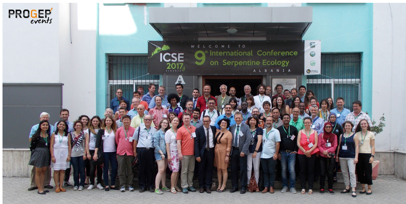
Fig. 1 Group photograph of the delegates of the 9th ICSE in front of the Conference Room Building at the Agricultural University of Tirana on the first day of the Conference (June 5, 2017)

ness of circumboreal ultramafic ecosystems in the Northern Hemisphere (Teptina et al. 2018), the specificity of the communities of lichens in ultramafic environments (Favero Longo et al. 2018) and the specificity of the associations of organisms present in the biological crusts on ultramafic vs. non-ultramafic soils (Venter et al. 2018).