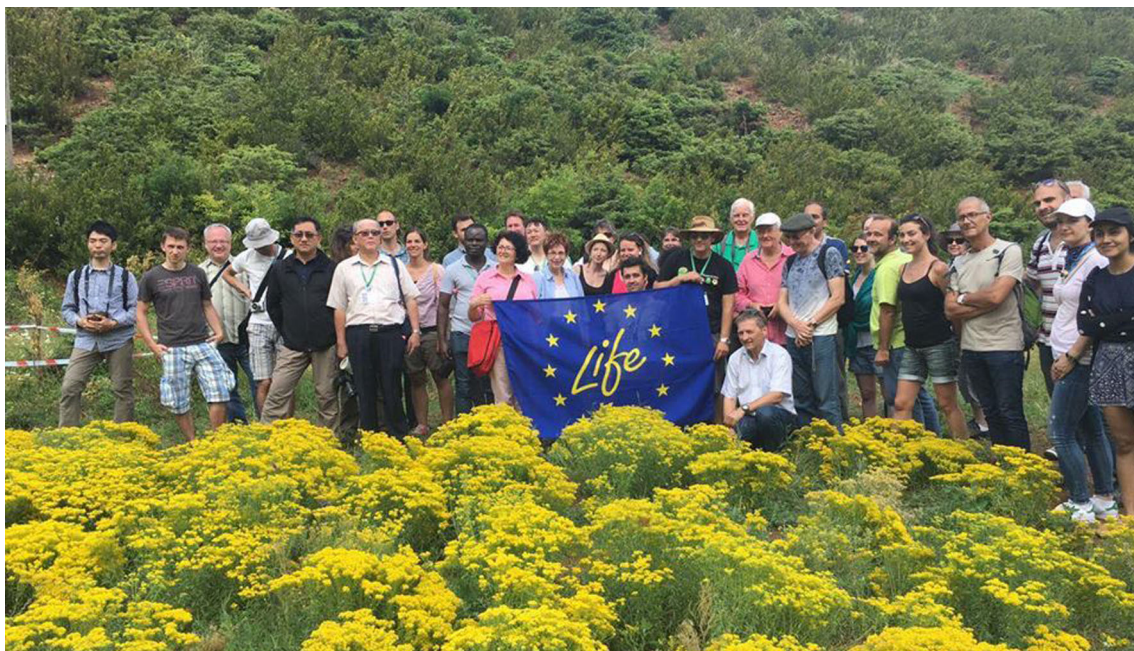
Fig. 2 Visit of the first full-scale nickel agromining field trial in Europe in Pojskë (District of Pogradec) by conference delegates during the mid-conference trip (June 8, 2017)

transporter in the Ni-hyperaccumulator Alyssum inflatum (Brassicaceae), it is concluded that high cytosolic \text{Ca}^{2+} is an important parameter that results in Ni tolerance. An investigation of the mechanisms involved in Mn hyperaccumulation by Phytolacca americana suggests that this trait may be a side effect of rhizosphere acidification as a phosphorus-acquisition mechanism, rather than an adaptation to high soil Mn per se (DeGroote et al. 2018). The final article in this section reports on a study on the interaction between Pb uptake and Fe nutrition in Matthiola flavidula (Brassicaceae), a facultative Pb hyperaccumulator from Iran (Dehno and Mohtadi 2018). All these studies give a better understanding of the mechanisms of metal hyperaccumulation and show how much this trait is related to the homeostasis of essential nutrients (such as Ca, P, Fe).